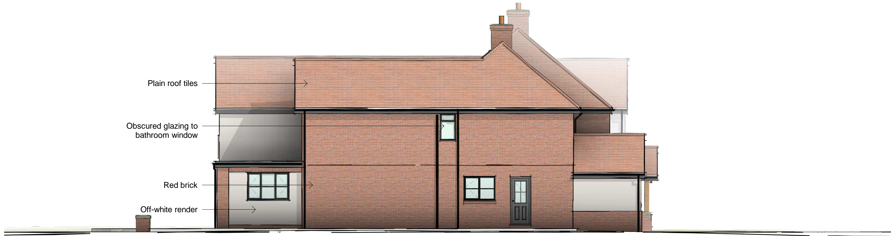
1 Proposed North Elevation 1 : 100