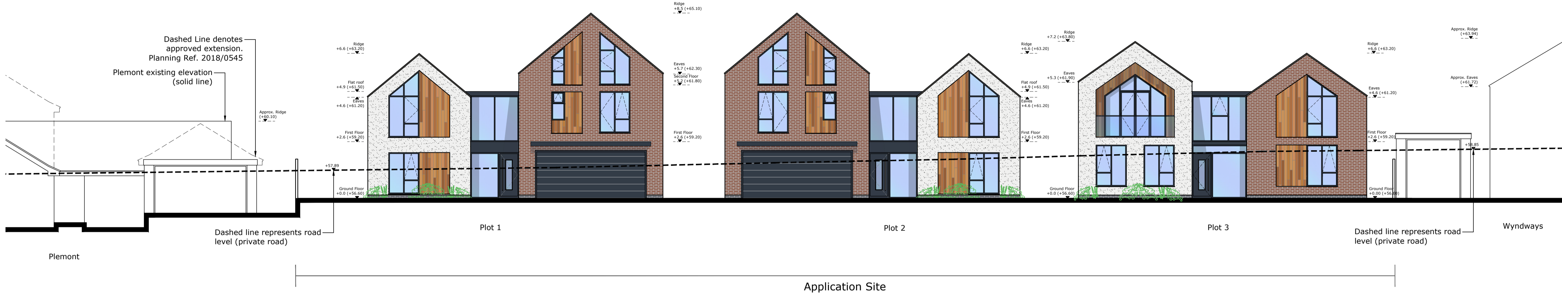
Proposed Street Elevation Scale 1:100 @ A1