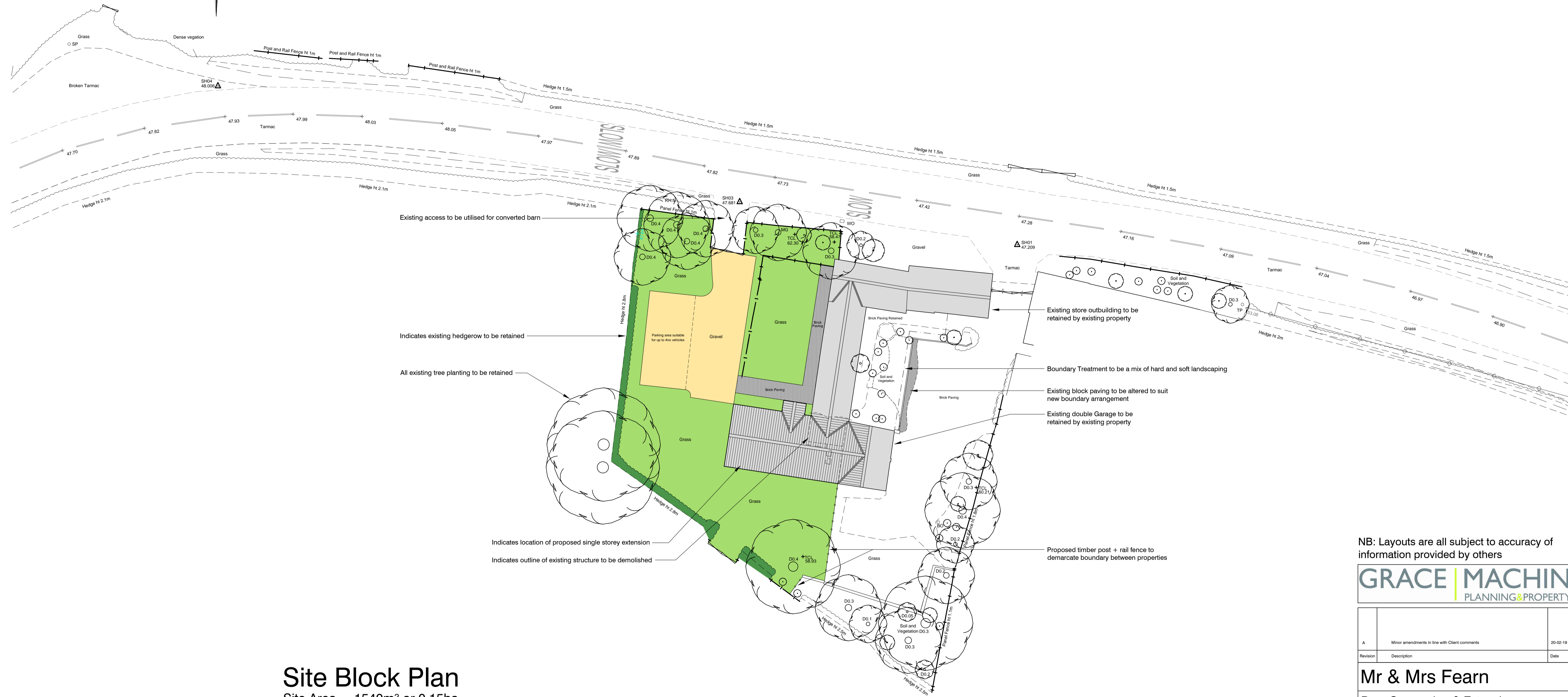
Site Block Plan Site Area = 1540m 2 or 0.15ha

NB: Layouts are all subject to accuracy of information provided by others