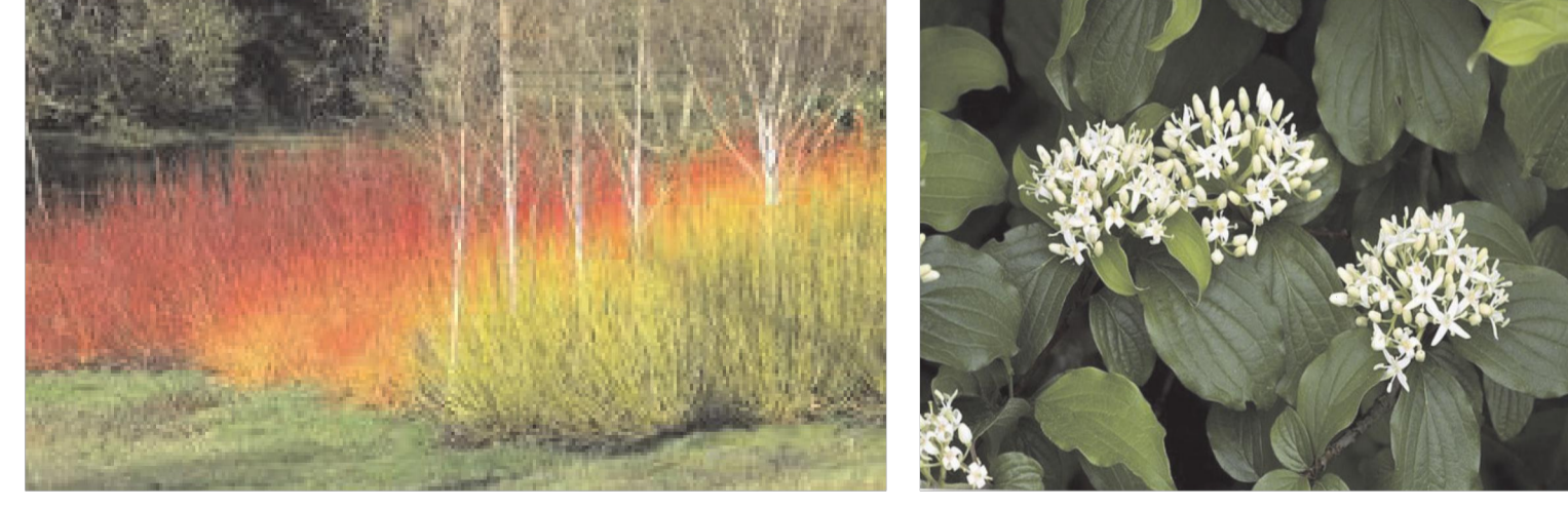
Swathes of Cornus shrubs

© This drawing and the building works depicted are the copyright of the Influence Environmental Ltd and may not be reproduced except with written consent. Figure dimensions only are to be taken from this drawing. All contractors must visit the site and be responsible for taking and checking all dimensions relative to their work. Influence are to be advised of any variation between drawings and site conditions. Do not scale off drawings. All dimensions to be checked on site.