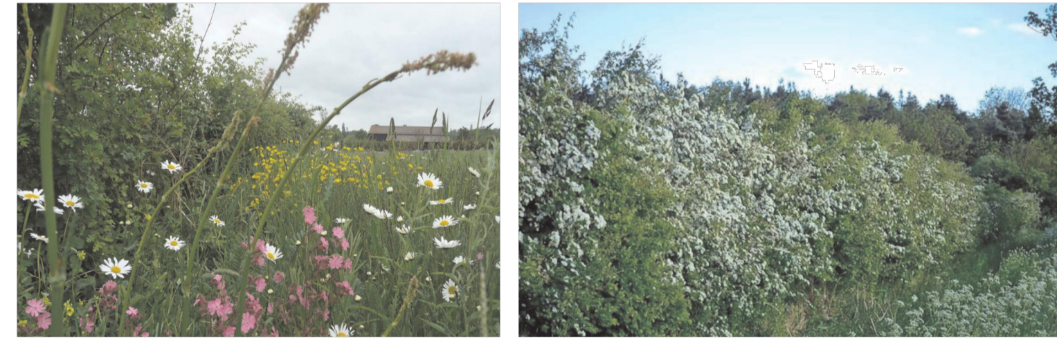
Native Hedgerow and Wildflower seeding to new and existing hedgerow