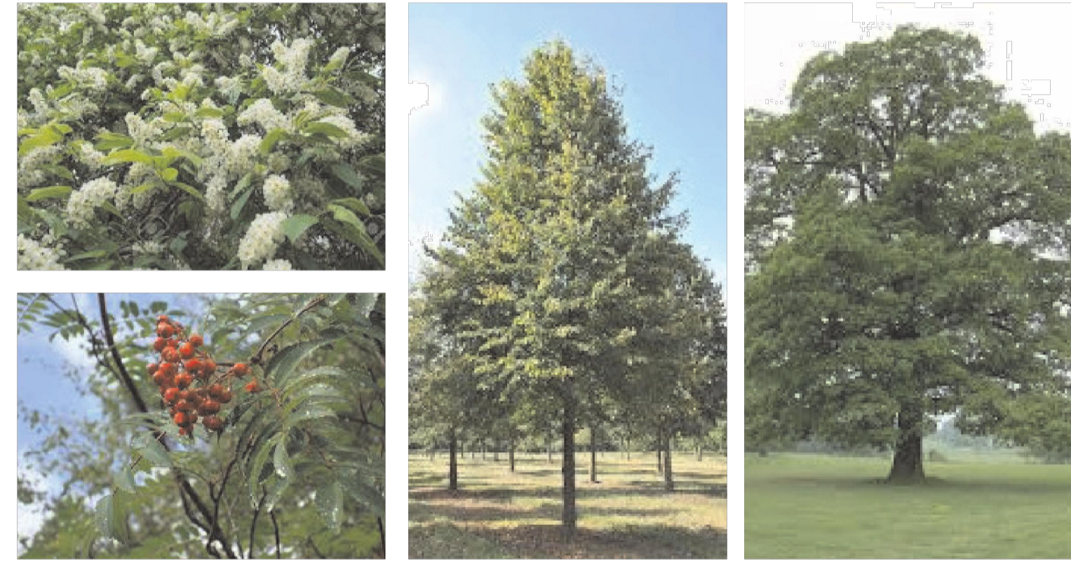
Native Tree Species