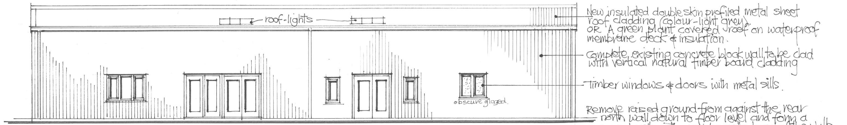
REAR NORTH ELEVATION - AS PROPOSED 1:100